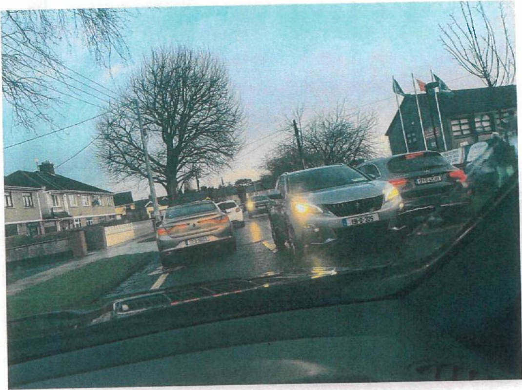
Ph.No.01 – Wednesday 11 th January 2023 @ 9.00AM

Member of the Royal Institute of the Architects in Ireland